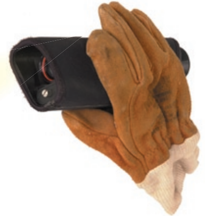
Recon LT Handheld Thermal Imager